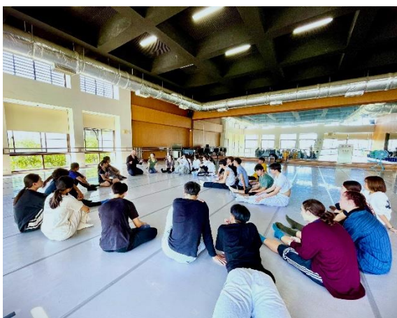
Masterclass on INVOCATION 101* - Taipei National University of the Arts